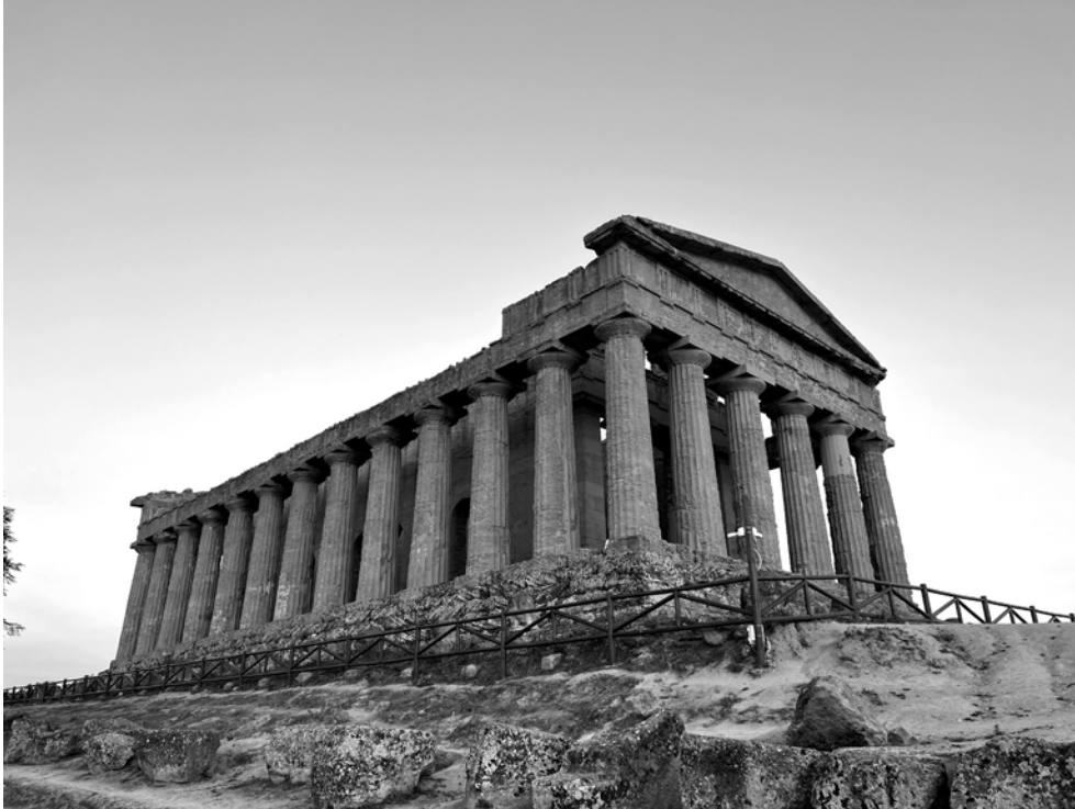
AGRIGENTO. Temple of the Concord.

itself with absolute rigor. And that this need continues to be felt as a prerequisite for any intervention, is confirmed by the very establishment, recently promoted by UNESCO, of an International Center for the Study of the Preservation and Restoration of Cultural Heritage. Already, the very title of this Center implies the concept of a protection that, having for its purpose the subsistence of cultural property as an indivisible whole, urges the definition and development of a new conception of the conservation of cultural property: that precisely of the meeting of general criteria and particular techniques through which the most diverse interventions can find a unified and coherent foundation. It is obvious, however, that while it is always possible to ensure the preservation of a movable object—even when it is no longer physically a participant in the present life—this is much more difficult for works of architecture, which, on the other hand, derive their sole possibility of subsistence precisely from constant participation in environmental and historical evolution.