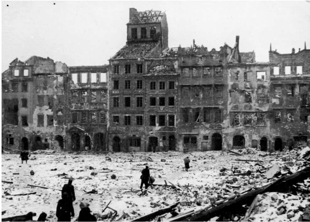
WARSAW. Stare Miasto (historic center) after World War II.

But in addition to the massive reconstructions motivated by exceptional occasions, we cannot fail to remember that, especially in the countries of northern Europe, the image of a past particularly dear to local traditions is present only because each crumbling element was progressively renewed with a new one, faithfully repeating its form. When I saw, many years ago, the cloister of Westminster, only a few sections of the walls still bore the marks of the severe decay of centuries; it is possible that today even those might have also been remade. And the same could be said of so many illustrious buildings whose artistic history, if it is to be complete, cannot hide the substantial reconstructions that were made even in the fairly distant past, so that their primitive face might continue. And for that matter, even in more favorable temperature conditions, the preservation of a more remote antiquity has motivated a whole series of successive replacements. Thus, the temple of Concord at Agrigento shows a modern history of its own, in the signs of the various restorations that have been made to it over more than two hundred years. Indeed, it may be said that for this very reason it provides a curious, if disappointing, historical record of the various methods followed to ensure the preservation of the monument while, to the layman's eye, it seems to provide an example of exceptional survival.