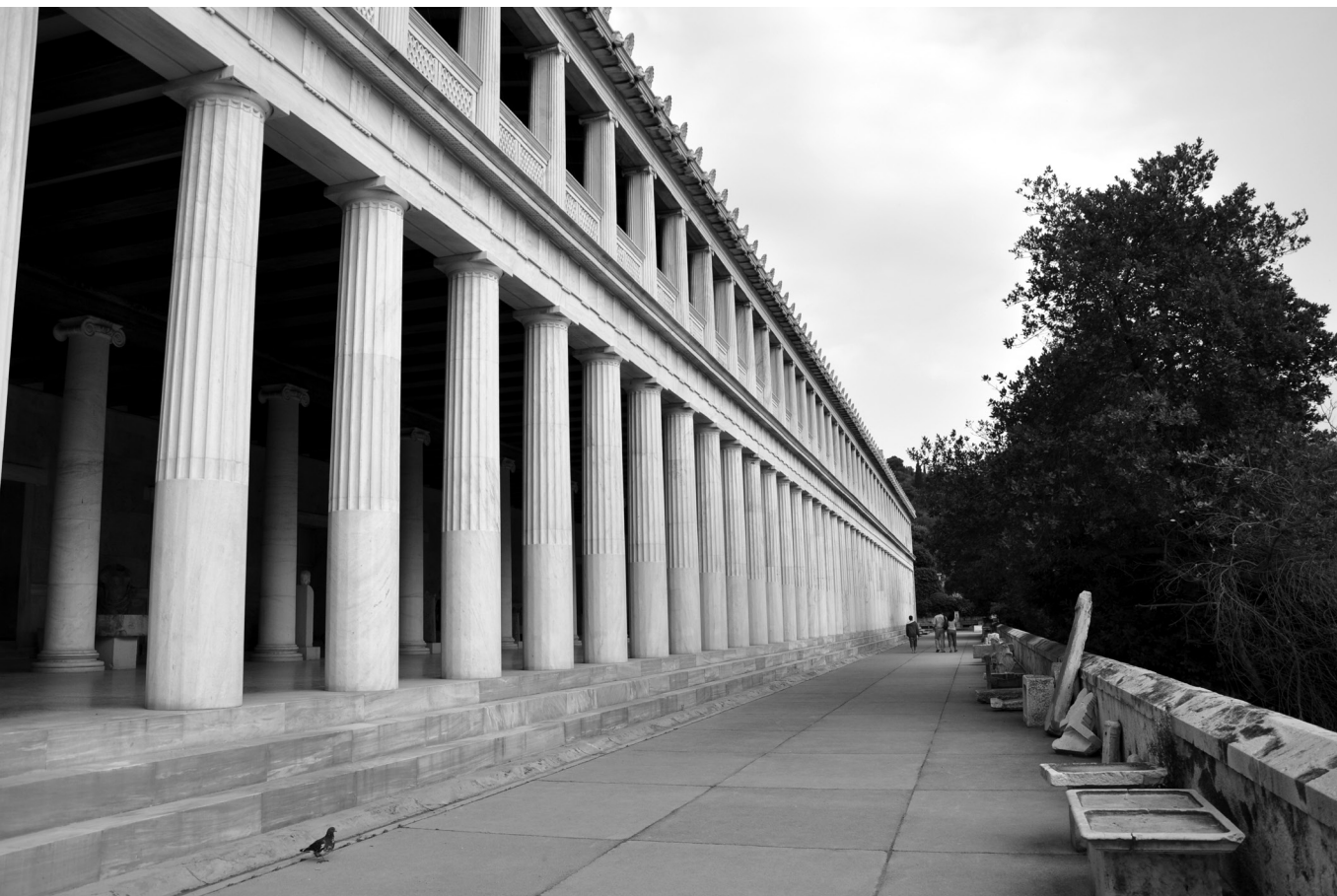
ATHENS. Stoa of Attalos. Image: Valerie Magar, 2010.

One would say, then, that cultural intransigence can even be interpreted as an insufficiency of democratic spirit; and it is evident that, by this means, the image of the monument can become an expression and symbol of broader meanings.