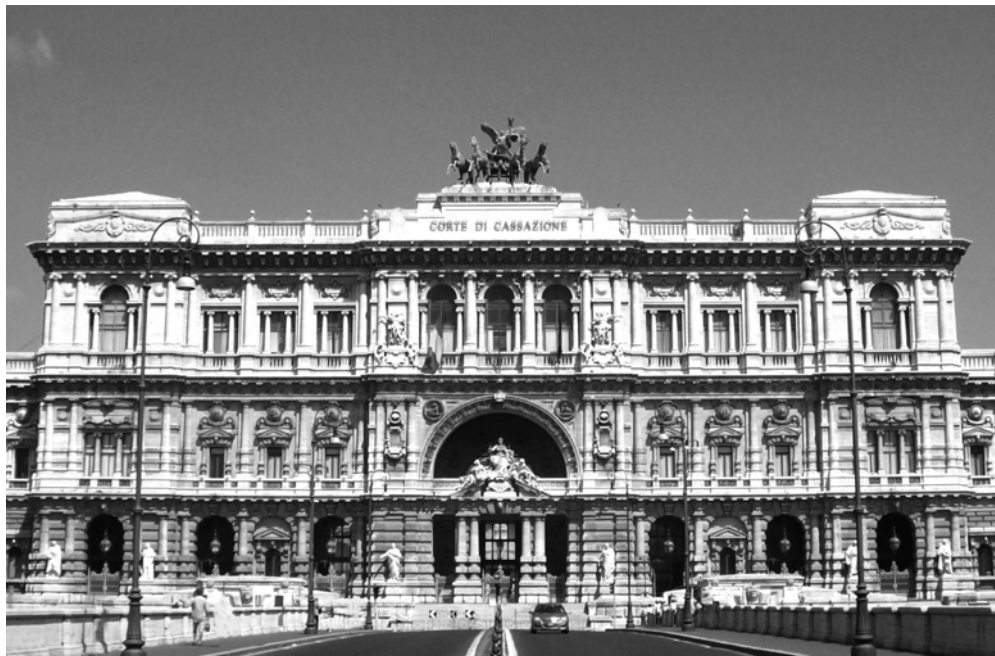
PALACE OF JUSTICE, ROME.