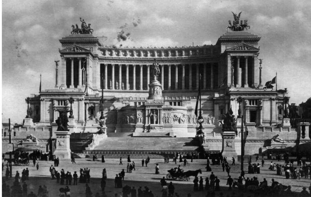
MONUMENT TO VITTORIO EMANUELE II, ROME.