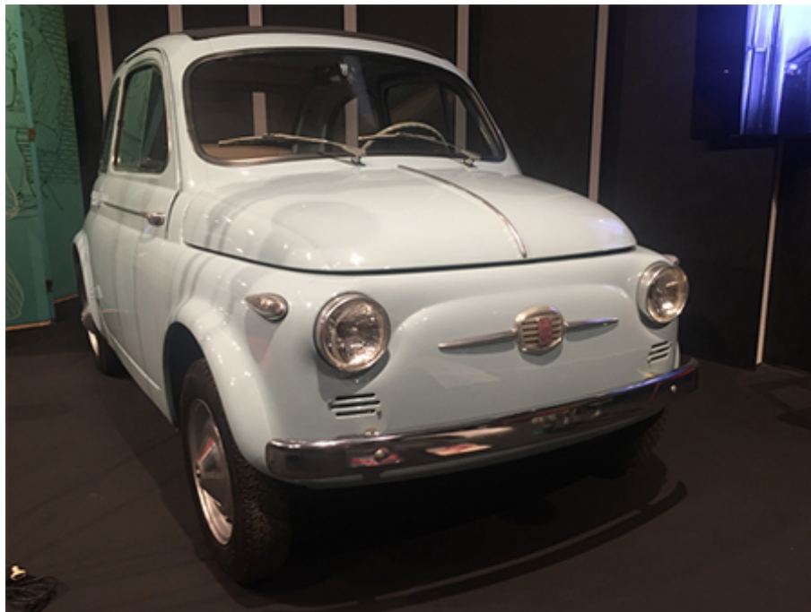
FIGURE 3 FIAT 500, designer Ing. Dante Giacosa, year 1957

The difficulty of providing an unambiguous definition of "Industrial Design" as a "Set" can thus be overcome by specifying the characteristics of industrially produced objects and highlighting whether or not they belong to that set.