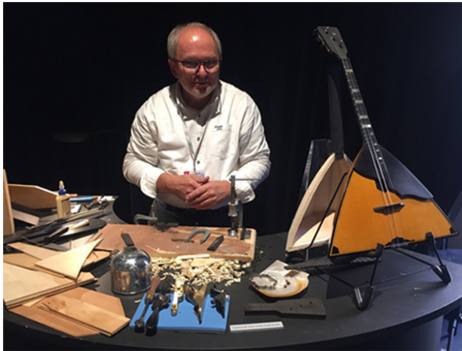
FIGURE 1 An artisanal producer of Balalaika

What distinguishes the "master craftsman" is mastery, that is, excellent skill in something, field or sector. The term mastery derives from master [lat. Magister], or one who fully knows some discipline, so as to possess it and to be able to teach it to others.