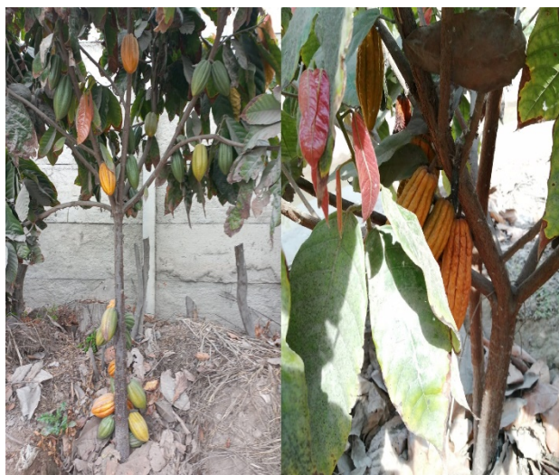
FIGURE 1 Wild Cocoa tree planted in Lima, Peru

The cocoa production is the main livelihood of 5-6 million of smallholders distributed in developing countries as Ivory Coast, Ghana, Indonesia, Nigeria, Cameroon, Brazil, Ecuador and Peru 1,2 . Within those countries, the cocoa production is located in forestland where it has an important ecological role maintaining the biodiversity of insects and plants, and increasing the carbon sequestration 3-6 . Likewise, cocoa production has key social role since it generates employment. For example, in Peru, around of 190 thousand families and 450 thousand people both depend on cocoa crop 7 (Figure 1).