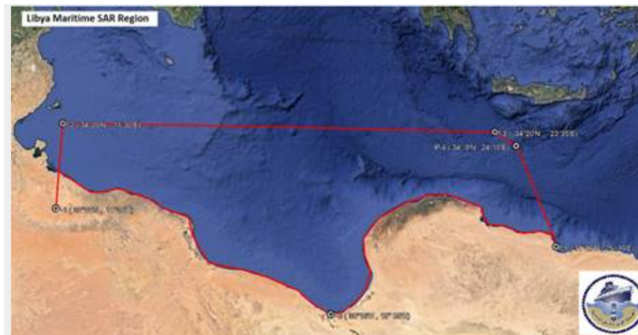
Figure 4: Libyan SAR region