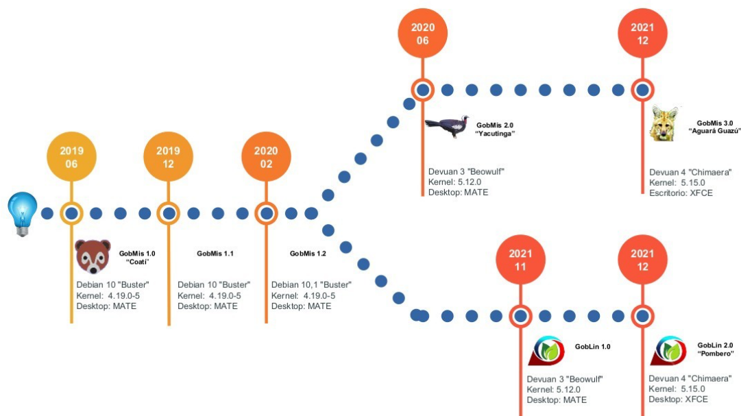
Figure 4. GobLin and his Timeline.

GobLin GNU/Linux is a fork of the GobMis GNU/Linux project [14], a project that was specifically designed to deliver a custom operating system for the government of the province of Misiones. But in order to share this system with other levels of government, we designed a neutral aesthetic and internationalized the languages, adding the English and Portuguese languages to the initial configuration that is in Spanish. In November 2021 we released version 1.0 based on Devuan 3, and we updated it to version 2.0 in December 2021 with the release of Devuan 4. From that date, GobMis and GobLin will be launched simultaneously, as shown in Fig. 4.