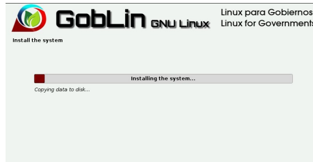
Figure 2. Installation Process.