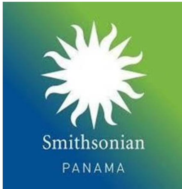
FIGURE 3. Logo of del Smithsonian Institute Panama.