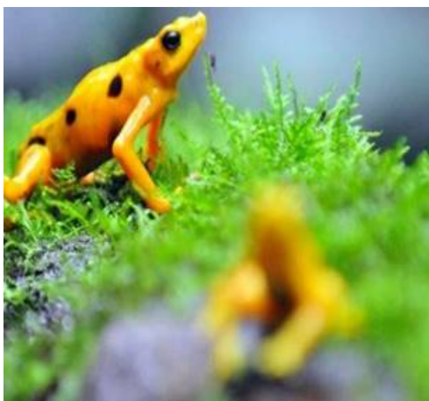
FIGURE 2. Golden frog.

Our scientific researchers are a truly international group, with 14 nations represented in their group. During our 100+ years in Panamá we have produced more than 14,000 scientific publications, and in 2019, had our best year ever, with more than 500 science papers released, an average of one paper every 17 hours! This work is a mixture of basic research as well as highly applied work, such as research on conservation of a national symbol, the golden frog ( Rana Dorada ), which is extinct in the wild because of a global fungal disease. Fortunately, we have enough of these amphibians in our quarantine facility in Gamboa where we can breed them for future release back into the wild.