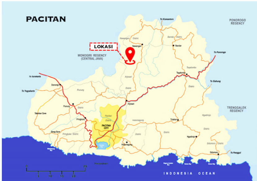
FIGURE 1. Map of the region of Tukul Irrigation

The construction of Tukul irrigation will definitely affect the surrounding region, which is Pacitan Regency. The area of Pacitan Regency is 1389.87 km 2 and consists of dry land with an area of 1259.72 km 2 and a rice field area of 130.15 km 2 . Pacitan is divided into 12 sub-districts, five urban villages, and 166 villages. The topography of Pacitan Regency consists of hills, mountains, and steep ravines, as well as Seribu mountain. Pacitan Regency shares borders on the north with Ponorogo Regency and Wonogiri Regency, on the east with Trenggalek Regency, on the south with the Indian Ocean, and on the west with Wonogiri Regency.