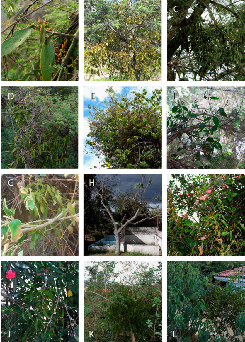
FIGURE 1-a: Photos of P. nervosum host species. A. Phoradendron nervosum. B. Acacia baileyana. C. Acacia macracantha. D. Acacia mearnsii. E. Annona cherimola. F. Callistemon subulatus. G. Croton wagneri. H. Ficus carica. I. Hibiscus rosa-sinensis. J. Nerium oleander. K. Nicotiana glauca. L. Prunus persica.

to infection by P. nervosum , we performed a chi-square goodness-of-fit test including the standardized residuals as post-hoc analysis using R statistical analysis software version 4.1.1 [18]. The relative frequency of each species was calculated.