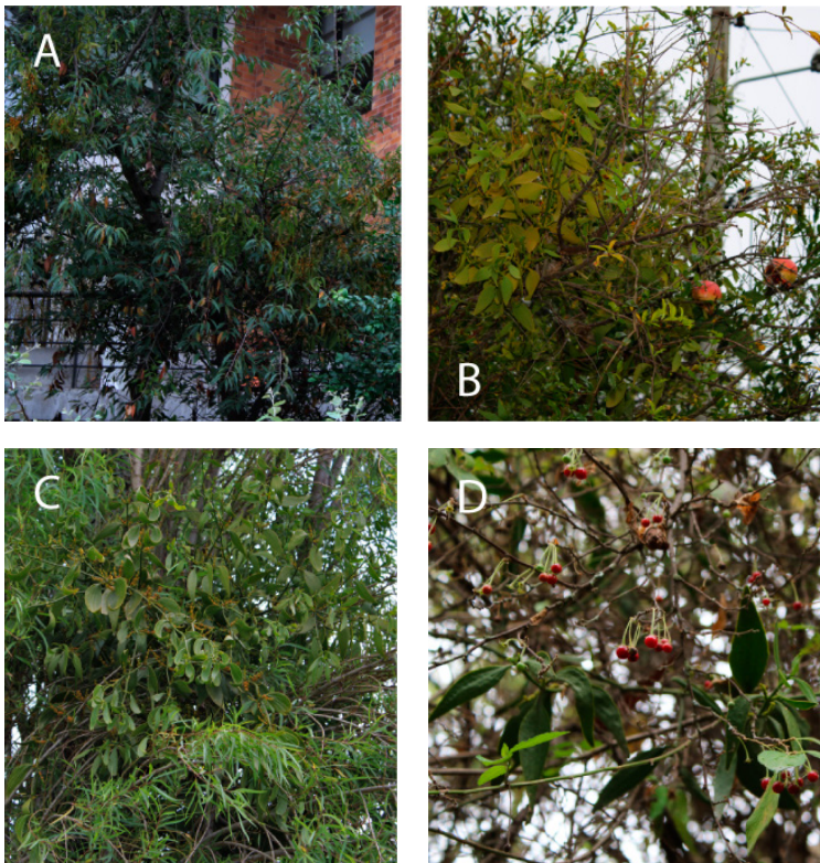
FIGURE 1-b: Photos of P. nervosum host species. A. Prunus serotina . B. Punica granatum . C. Salix humboldtiana . D. Solanum brevifolium .

P. nervosum appears to be a generalist hemiparasite plant, infecting 21 species from 14 families from the Eudicotyledonae class. The family with more frequently infected species is Fabaceae (4 species), followed by Malvaceae (3 species) and Solanaceae and Rosaceae (each with 2 species). In families like Apocynaceae, Asteraceae, Bignoniaceae, Lythraceae, Myrtaceae, Salicaceae, and Verbenaceae, we only found one infected species (Fig 1 a-b). From the 140 infected individuals reported, the four species with highest relative frequency are Acacia mearnsii with 22.30 %, followed by Callistemon subulatus with 14.29 %, Salix humboldtiana with 13.57 %, and Nicotiana glauca with 10.00 %. We registered 3 infected species with only one individual ( Tecoma stans , Acacia baileyana , and Annona cherimola , each with 0.71 %) (Table 2).