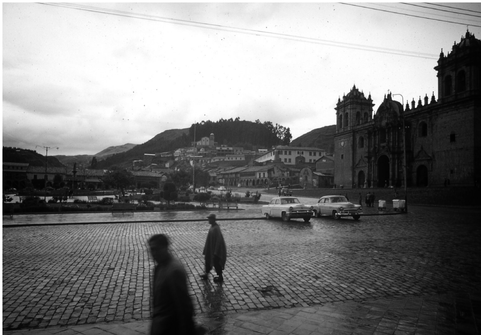
CATHEDRAL'S SQUARE, CUSCO. 1960s.