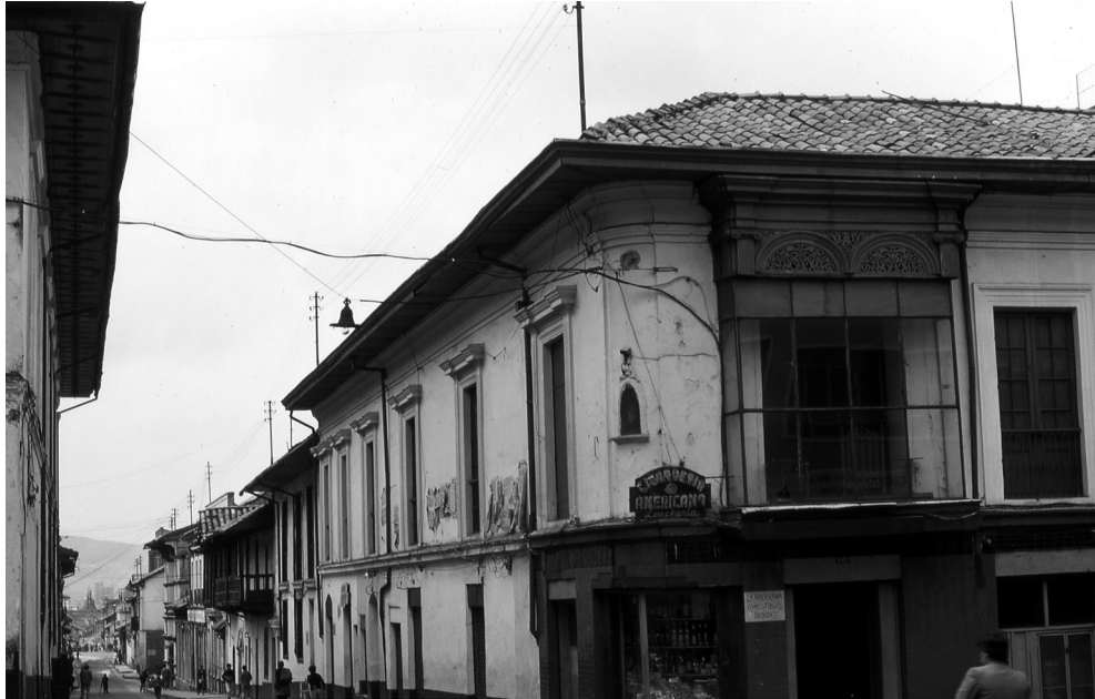
CANDELARIA, BOGOTÁ.

that this serves those who, being a living part of that urban conglomerate, have suffered the indifference of living in the old part of the city. It is important to do tourism with personality, not on our knees, and for this, it is urgent to create a platform of citizen awareness that prevents thoughts of abandoning some of our cities to the sole tourist influence, stripping them of internal life and personality.