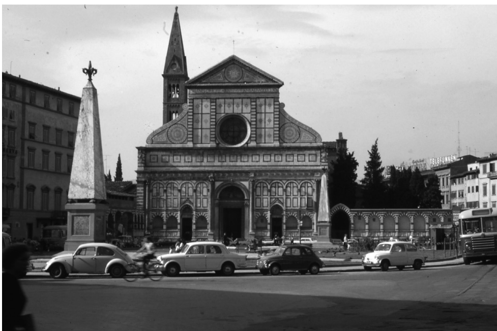
SANTA MARIA NOVELLA, FLORENCE.