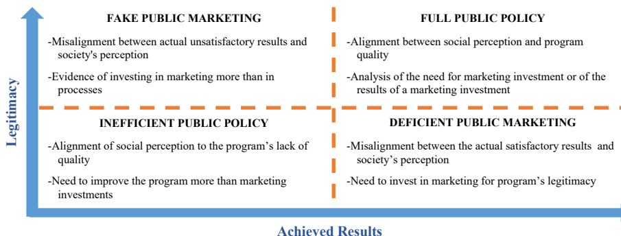
Figure 3. Comparison between the degree of achieved results and legitimacy

The deficient public marketing dimension is due to the existence of a well-conducted, efficient and effective public policy, which attains its established objectives; however,