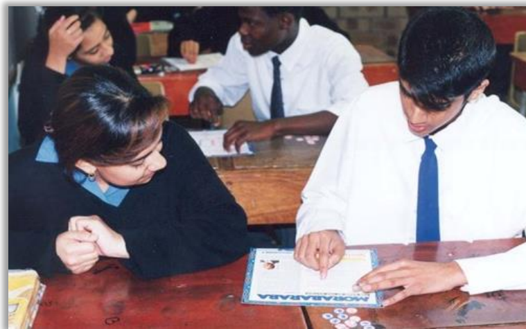
Figure 6: Learners referring to Morabaraba rules (MOSIMEGE, 2000, p. 235)

On a number of occasions, learners were video recorded studying the rules of the game before starting to play the game (Figure 6).