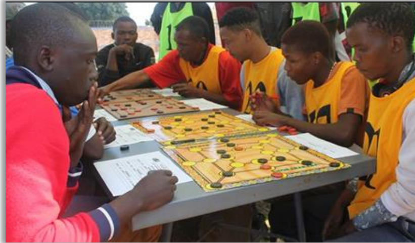
Figure 1: Players participating in the Indigenous Games Festival — Morabaraba Games

In Figure 2, a team comprising of girls and boys demonstrate the playing of the Kgati game. While the girls are skipping the rope, the boys are also playing a part in the movements of the rope. This is a game that clearly illustrates that both boys and games can play the game.