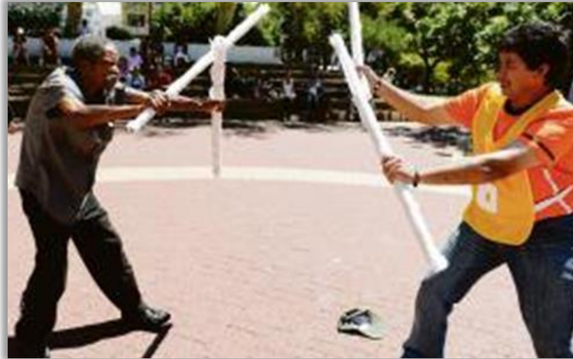
Figure 3: Players participating in the Indigenous Games Festival — Intonga Game (Department of Sports and Recreation, South Africa)

The Indigenous Games Festival are aimed at building a diverse society by embracing common national identity and celebrating a shared heritage. The annual Indigenous Games Festival has also assisted that the identified games — and other games not in the List that was launched — become the focus of research studies in Mathematics Education and other disciplines like Psychology of Education in South Africa, including other countries in Southern Africa.