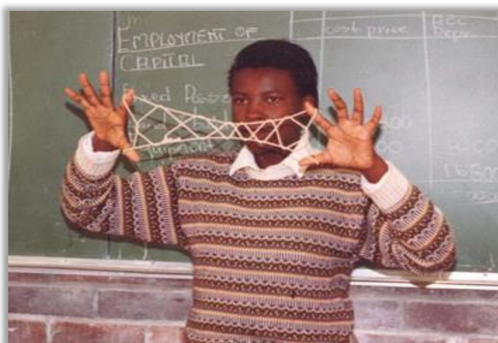
Figure 8: A demonstration of Figure Gate Six (Malepa a borataro) by a female Learner (MOSIMEGE, 2000, p. 207)

In figure 8, there is a demonstration of Figure Gate Six, which is a Malepa a borataro, performed by a female student.