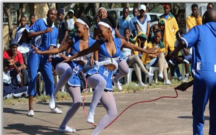
Figure 2: Players participating in the Indigenous Games Festival — Kgati Game

In Figure 2, a team comprising of girls and boys demonstrate the playing of the Kgati game. While the girls are skipping the rope, the boys are also playing a part in the movements of the rope. This is a game that clearly illustrates that both boys and games can play the game.