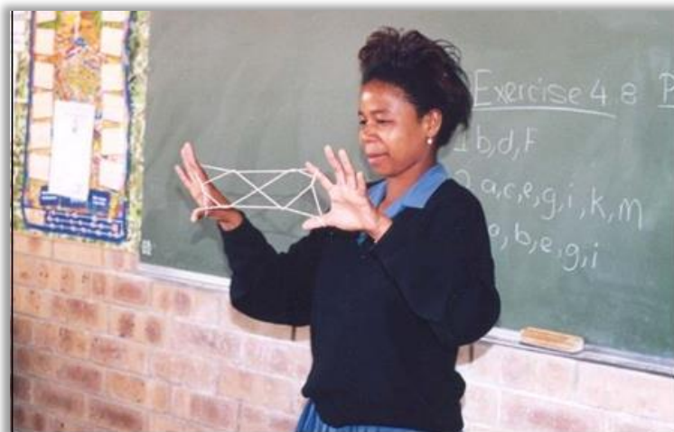
Figure 7: A demonstration of Figure Gate Two (Malepa a bobedi) by a female learner (MOSIMEGE, 2000, p. 201)

In figure 8, there is a demonstration of Figure Gate Six, which is a Malepa a borataro, performed by a female student.